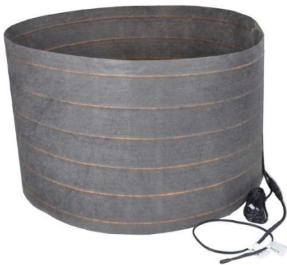
ThermoSoil Root Warmer - Series 120/240 Volt With Dual Air/Soil Thermostat

The basic system consists of one or more ThermoSoil Root Warmers and a Dual Air/Soil Thermostat for independent temperature control of each Root Warmer. Direct wall plug or water-proof power connectors are available for easy connection of multiple systems and for scaling up to any size operation.