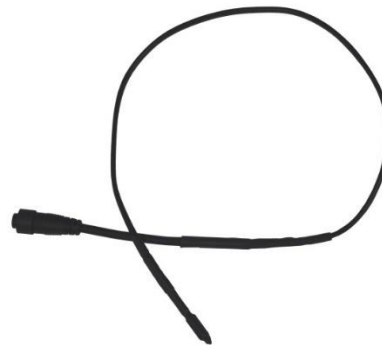
Dual Air/Soil Thermostat